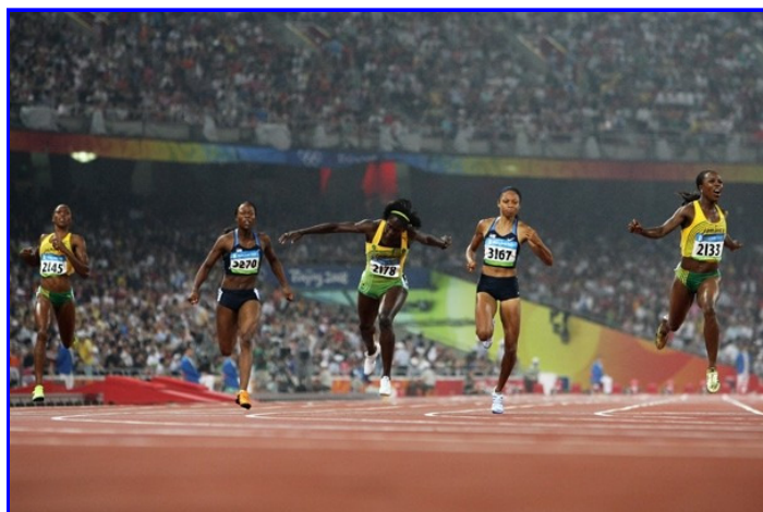
Veronica Campbell-Brown wins the Olympic 200m title as four women run 22.01 or faster