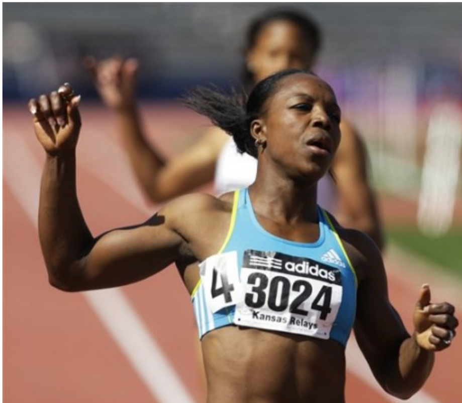
Veronica Campbell-Brown crosses the finish line of the women's 200-meter Invitational in the Kansas Relays Track and Field meet Saturday, April 17, 2010, in Lawrence, Kan. Campbell-Brown, a two-time Olympic gold medalist in the event, won with the time of 22.32.

LAWRENCE, Kan. (AP) — Five-time Olympic medalist Veronica Campbell-Brown of Jamaica set a meet record in the 200 meters at the 83rd annual Kansas Relays, winning in 22.32 seconds Saturday.